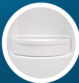
Removable Drip Tray