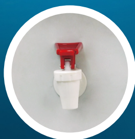
Tomlinson® Touch Guard® hot water faucet