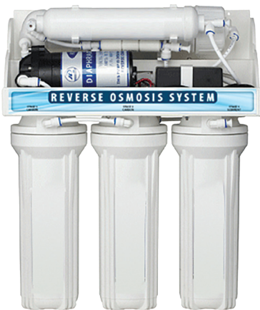
Booster Pump Model: RO75BP